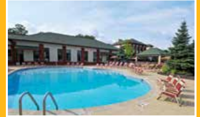
Quail Hollow Resort, Concord with group tour special pricing