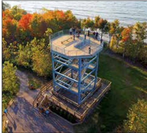
Lake Metroparks Lake Erie Bluffs Observation Tower 50 Feet High, 100 Feet Above Lake Erie

Rise to new heights with two new Observation Towers, one with an inspiring Lake Erie View and the other with a 3,600 acre Arboretum View!