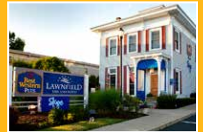
Best Western Lawnfield Inn & Suites, Mentor