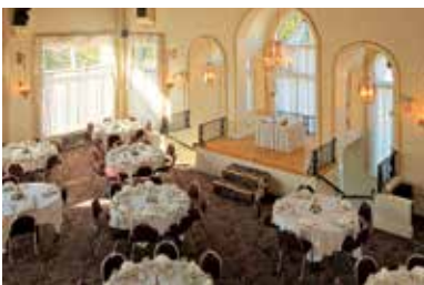
Lake Metroparks Pine Ridge Country Club For group meal functions

David Cassidy (above) tipifies Lake County's Joe Babe Productions Dinner/Entertainment Packages.