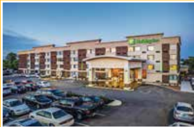
Holiday Inn Mentor/Cleveland

Rise to new heights with two new Observation Towers, one with an inspiring Lake Erie View and the other with a 3,600 acre Arboretum View!