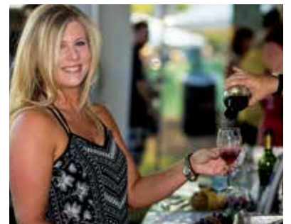
Vintage Ohio Wine Festival • August 4-5, 2017 Past American Bus Association Top 100 Event Winner