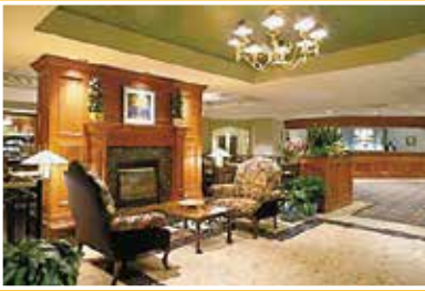
Radisson Hotel & Suites, Eastlake