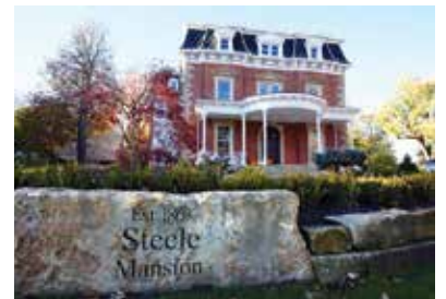
Historic Luxurious, Steele Mansion Inn, Painesville