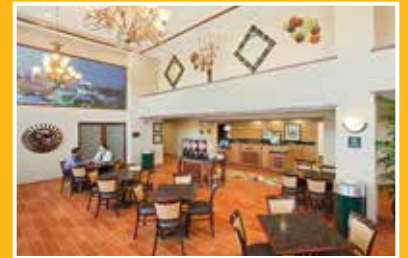
Hampton Inn & Suites, Mentor