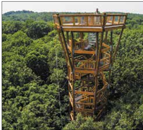
The Holden Arboretum's 120 Foot High Emergent Tower overlooking 3,600 acres